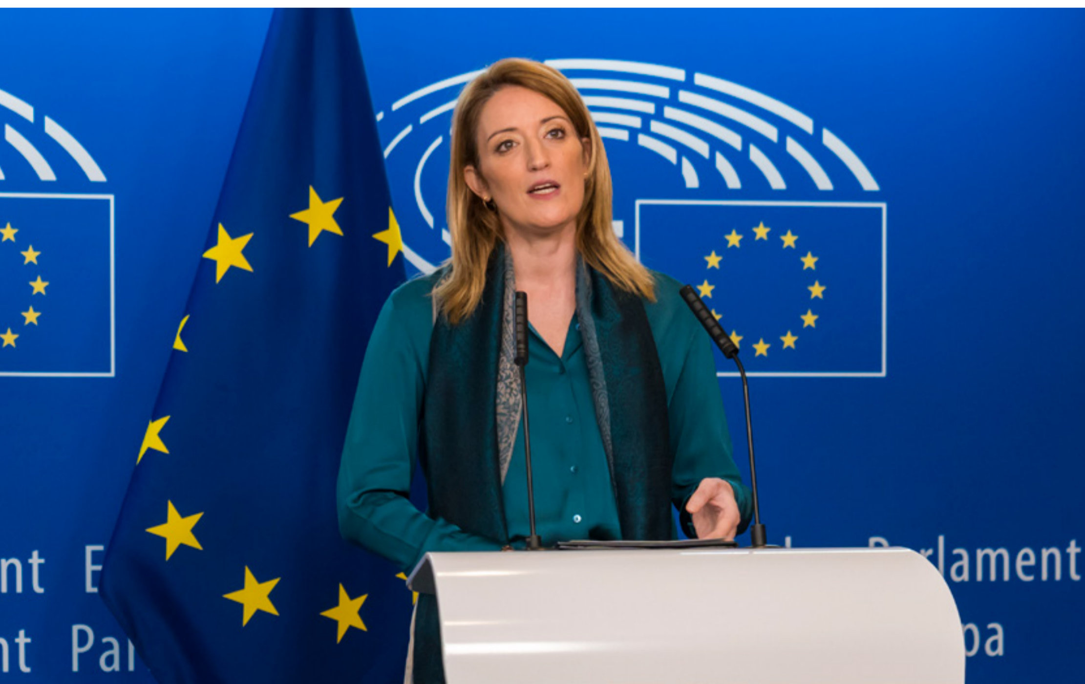
Figure out how the Parliament can accompany other countries on their path to democracy through dialogue, advancing human rights, observing elections, and helping partner parliaments better serve their citizens.

Learn why the European Parliament is a firm defender of human rights and of democracy around the world.