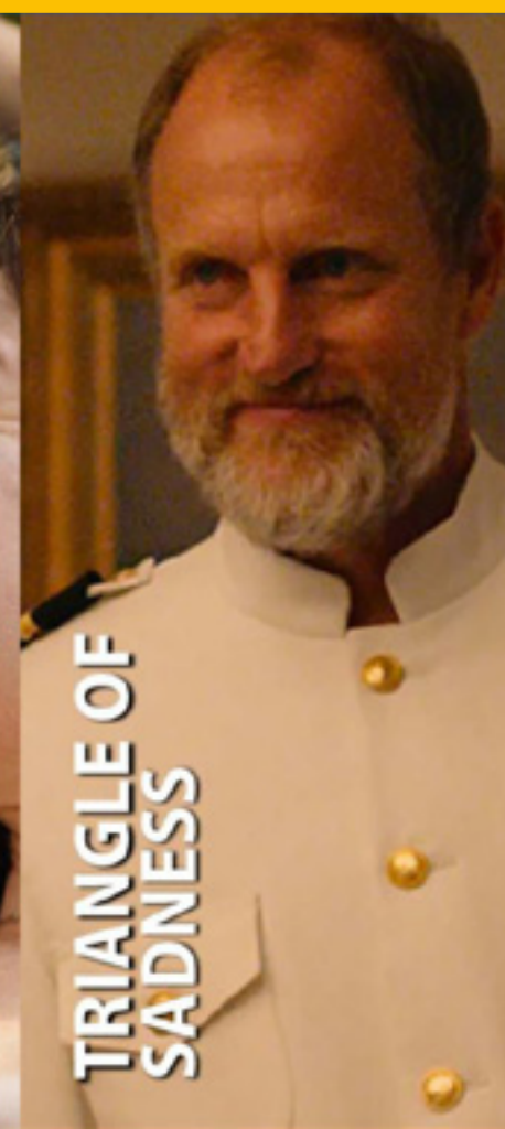
TRIANGLE OF SADNESS